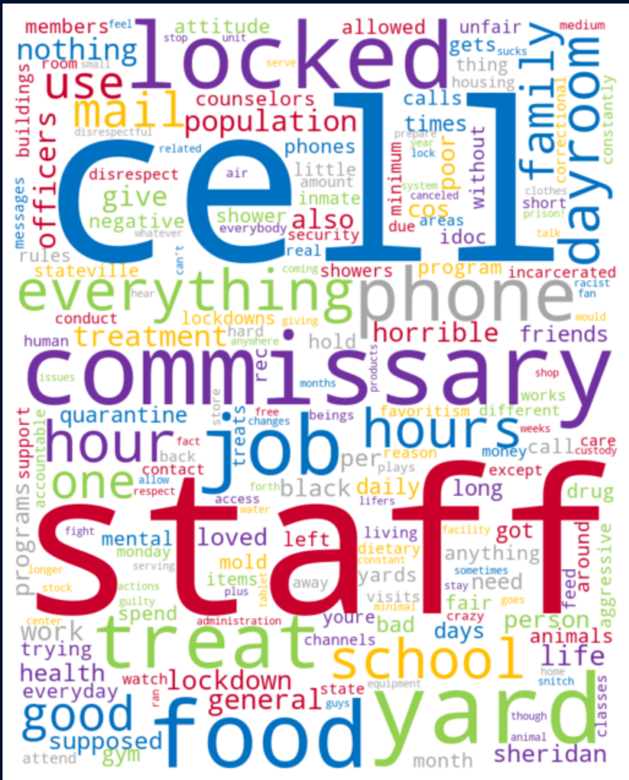
Word cloud generated using the most common words used in Sheridan survey responses to the question "What are the most negative things about life in this prison?"