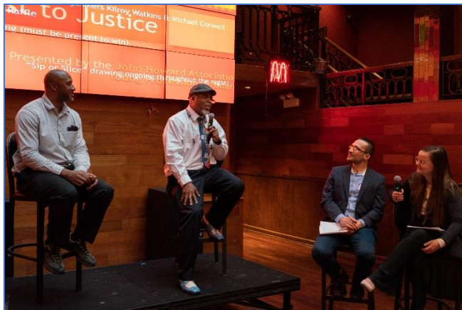
Above: Men from St. Leonard's Ministries share their prison and re-entry experiences at a JHA event

Visit our website for more press featuring JHA.