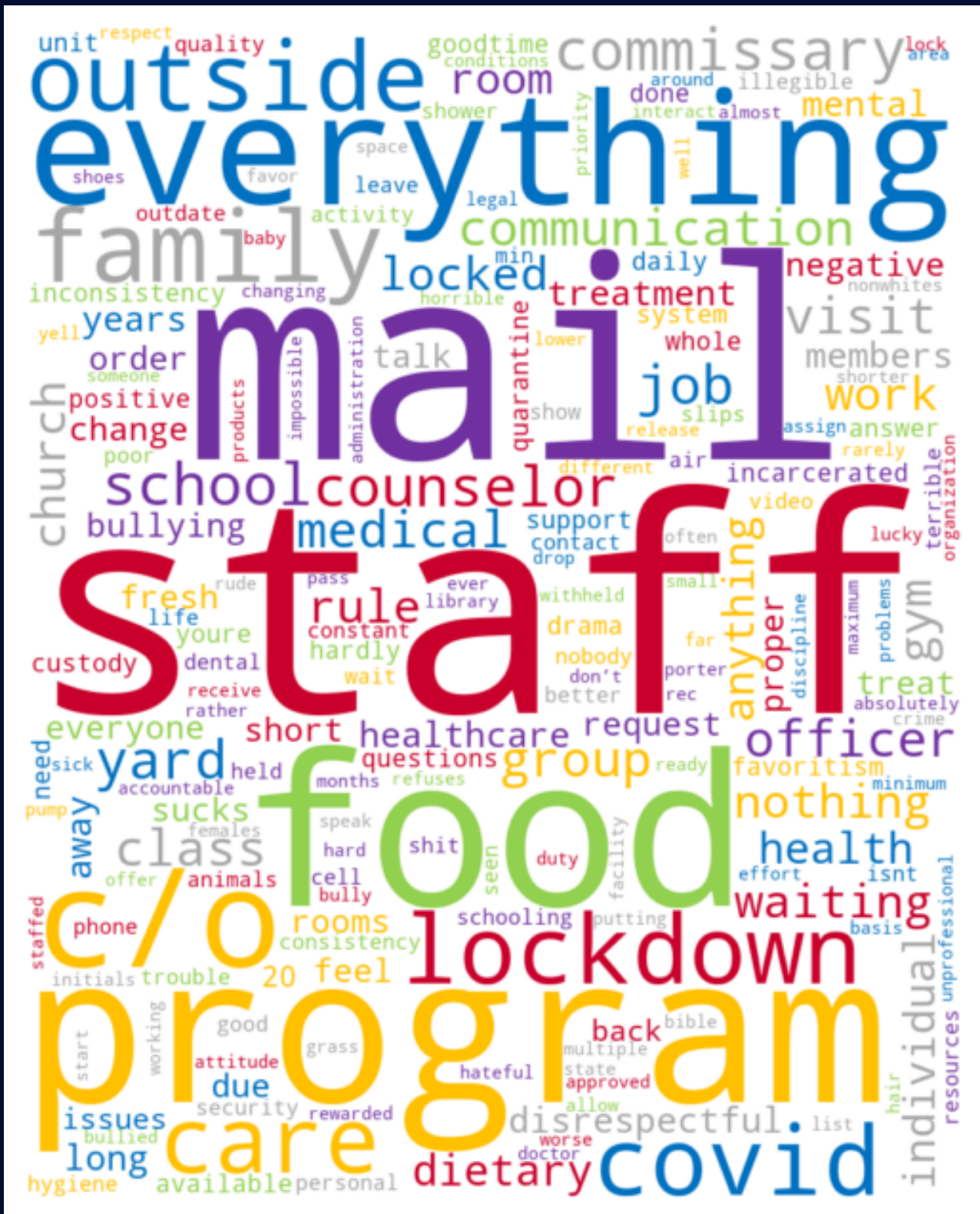
Word cloud generated using the most common words used in Decatur survey responses to the question "What are the most negative things about life in this prison?"