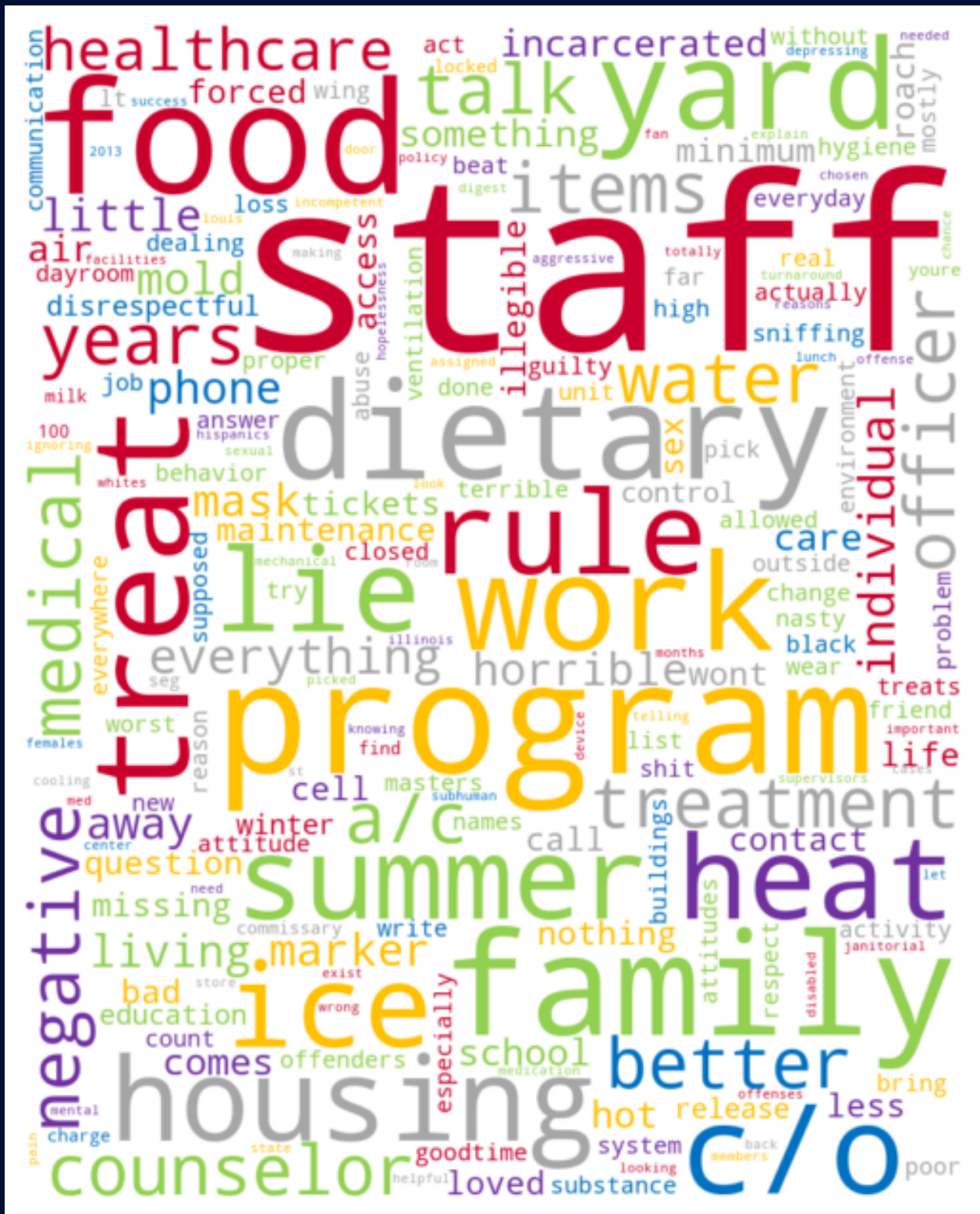
Word cloud generated using the most common words used in East Moline survey responses to the question "What are the most negative things about life in this prison?"