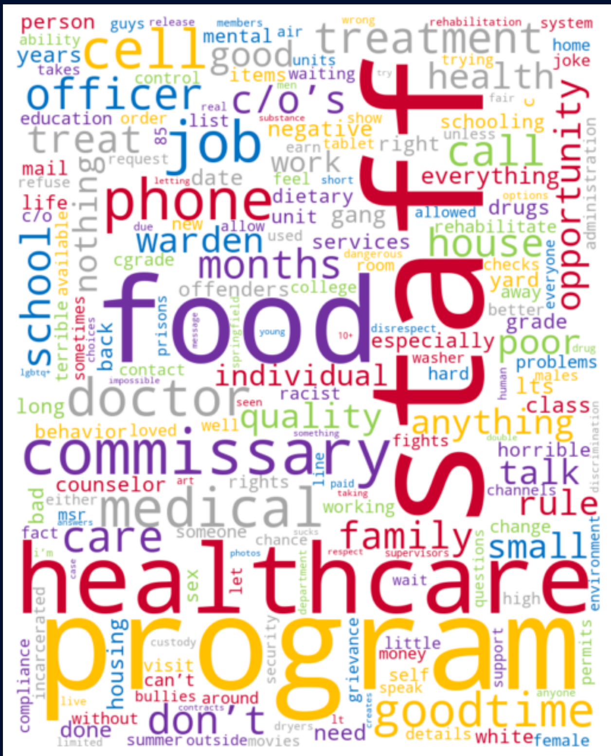
Word cloud generated using the most common words used in Centralia survey responses to the question "What are the most negative things about life in this prison?"